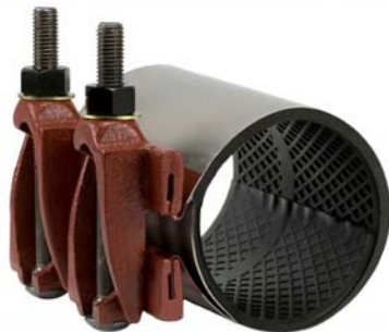
JCM 101 Universal Clamp Coupling Image reflects 6" width

JCM 100 Series Universal Clamp Couplings meet or exceed ANSI/AWWA C230 Standard for Stainless –Steel Full-Encirclement Repair and Service Connection Clamps as applicable.