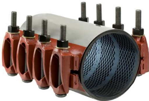
JCM 102 Multi Band Universal Clamp Coupling Image reflects 12" width

JCM 100 Series Universal Clamp Couplings meet or exceed ANSI/AWWA C230 Standard for Stainless –Steel Full-Encirclement Repair and Service Connection Clamps as applicable.