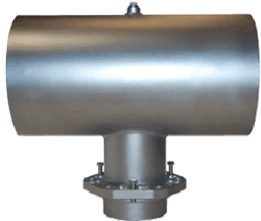
NEW JCM Surge Suppressor