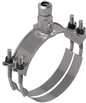
Powerjoint - CTS