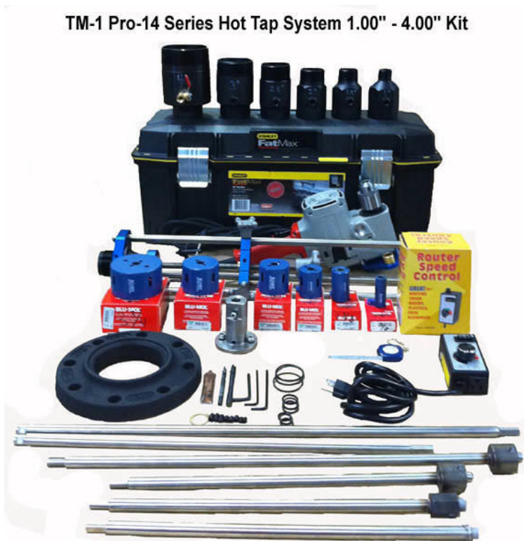
TM-1 Pro-14 Series Hot Tap System 1.00" - 4.00" Kit